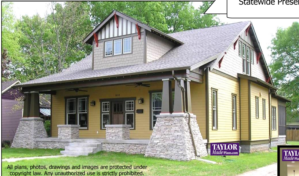
All plans, photos, drawings and images are protected under copyright law. Any unauthorized use is strictly prohibited.

2007 Infill Award Winner Tennessee Preservation Trust Statewide Preservation Award